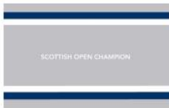
SCOTTISH OPEN CHAMPION.