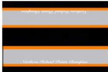
NORTHERN IRISH SERIES CHAMPION