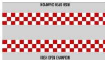
IRISH OPEN CHAMPION.