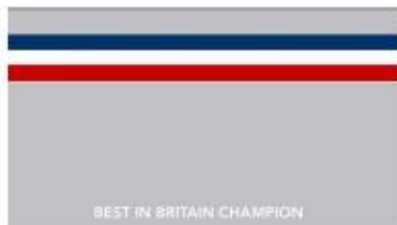
BEST IN BRITAIN CHAMPION