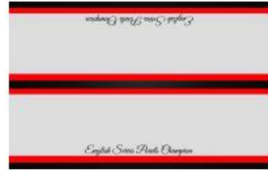
ENGLISH SERIES POINTS CHAMPION.