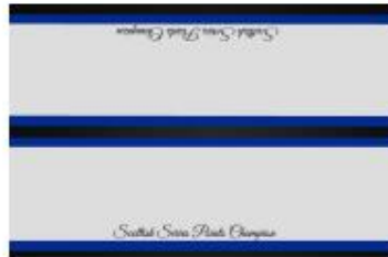
SCOTTISH SERIES CHAMPION