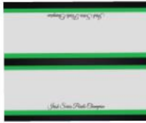
IRISH SERIES POINTS CHAMPION.