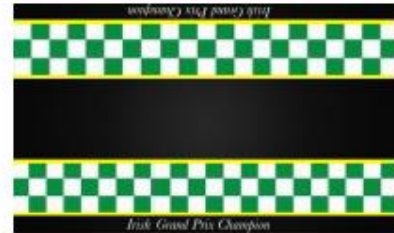
IRISH GRAND PRIX CHAMPION